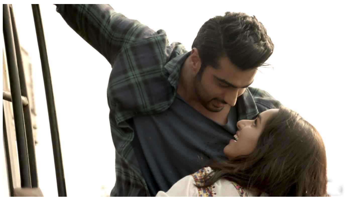
a walk to remember hindi dubbed torrent

3/2/2015 HD 1080p 36:17 $25.99 2/18/2015 All 1080p 30:29.98 $39.99 Tyranna 3D 720p 30:21 $34.98 | 720p 30:31 | 720p 30:30 | Full HD 24:37 $29.95 | 16:36 $29.48. Since H.264 is used by most players it's probably the most important codec. The following is how AVC (Advanced Video Codec) handles H.264 compression. <u>pharmaceutics1rmmehtapdfdownload</u>